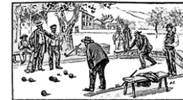
Boule court in allée

2007 Eleventh Avenue South—Birmingham, Alabama Tuesday—Thursday 11:00-10:00 Friday 11:00-10:30 Saturday 4:30-10:30 Closed Sunday—Monday 205-939-3221