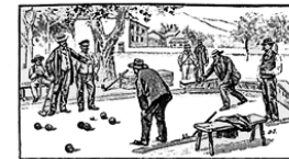
Boule court in allée

Sauternes Château Lions de Suduiraut '12 10.00/glass Moscato d'Asti Vietti '16 6.00/glass